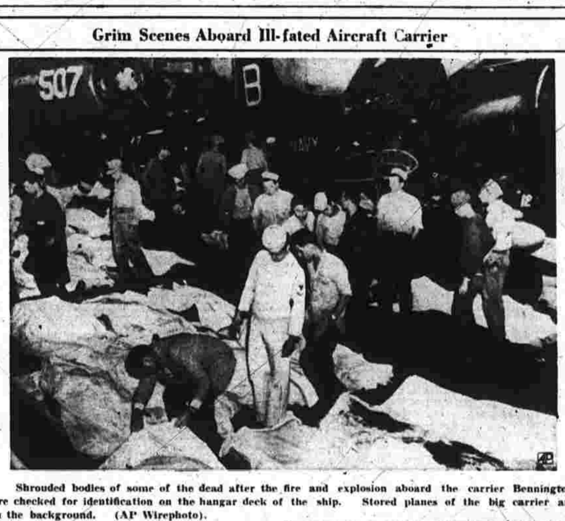
Grim Scenes Aboard Ill-fated Aircraft Carrier